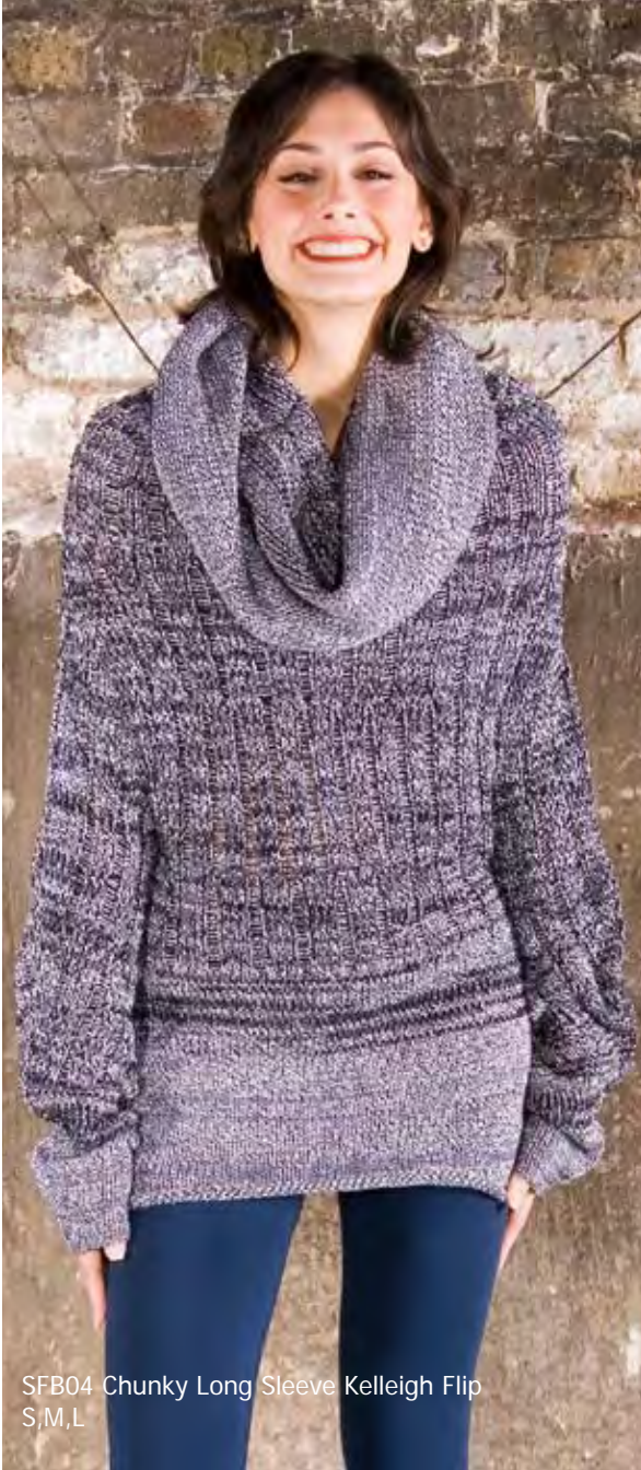
SFB04 Chunky Long Sleeve Kelleigh Flip S,M,L