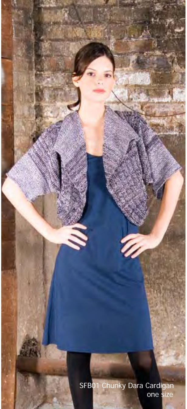
SFB01 Chunky Dara Cardigan one size