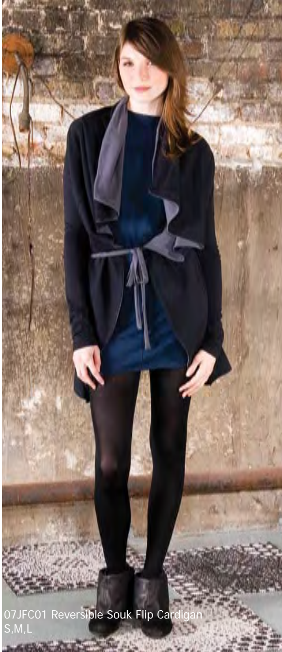
07JFC01 Reversible Souk Flip Cardigan S,M,L