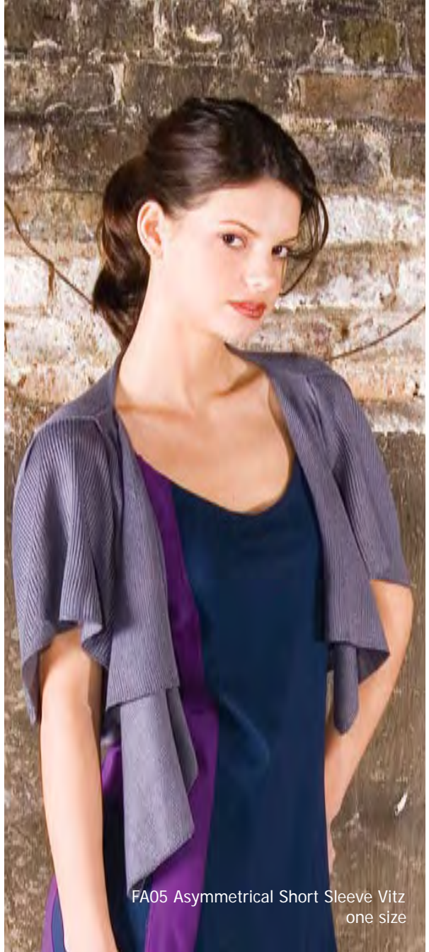
FA05 Asymmetrical Short Sleeve Vitz one size