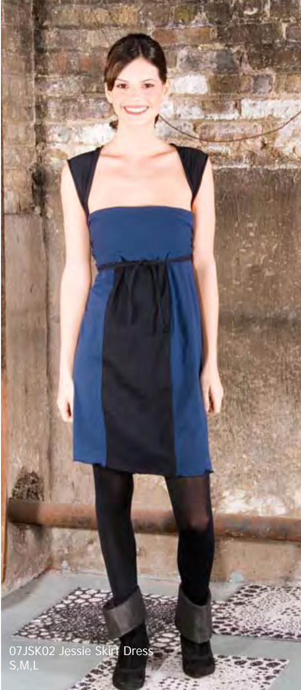
07JSK02 Jessie Skirt Dress S,M,L