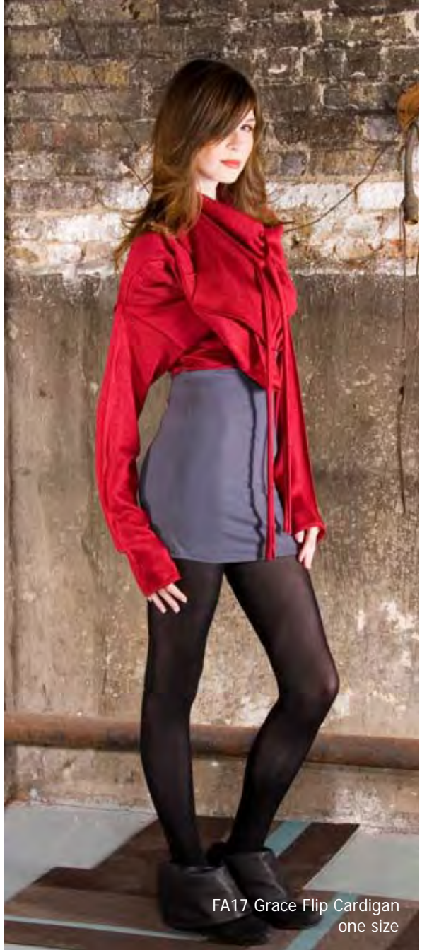
FA17 Grace Flip Cardigan one size