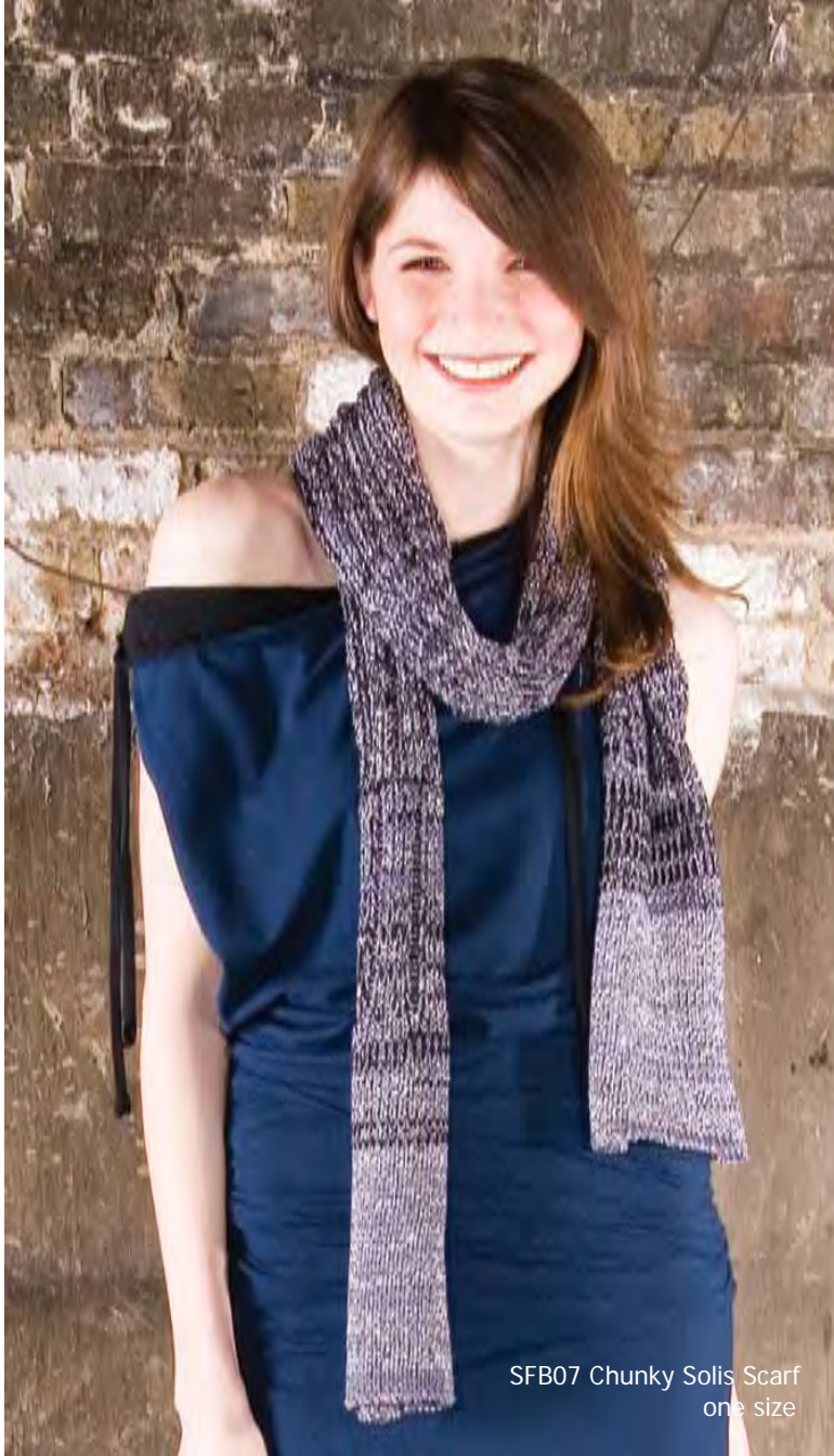
SFB07 Chunky Solis Scarf one size