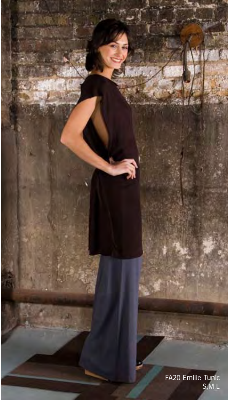
FA20 Emilie Tunic S,M,L