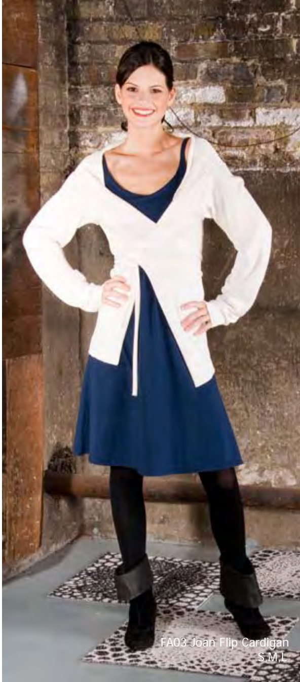
FA03 Joan Flip Cardigan S,M,L