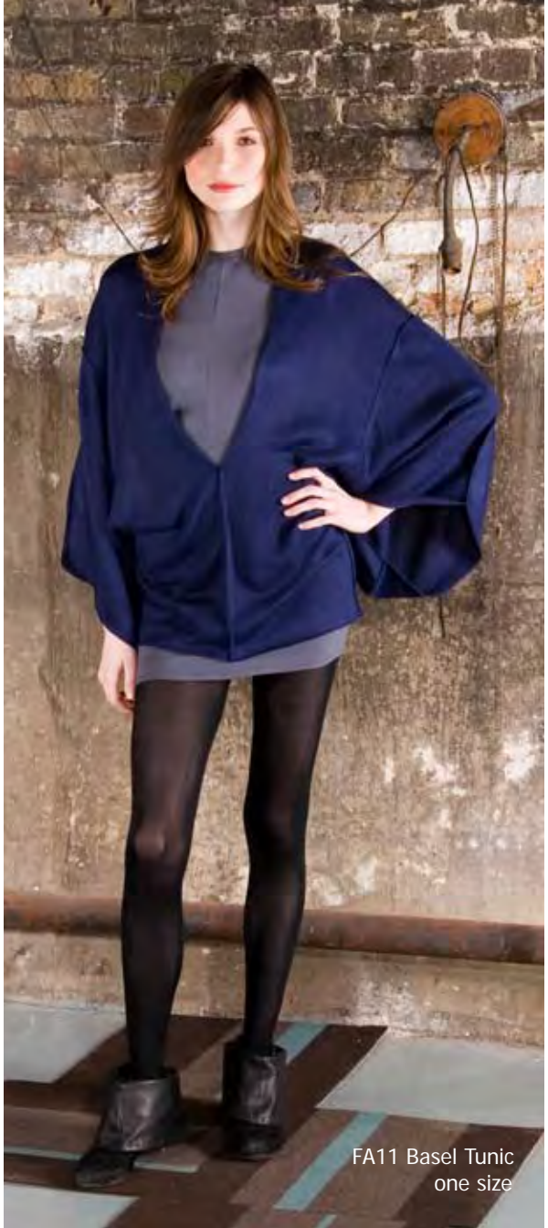
FA11 Basel Tunic one size