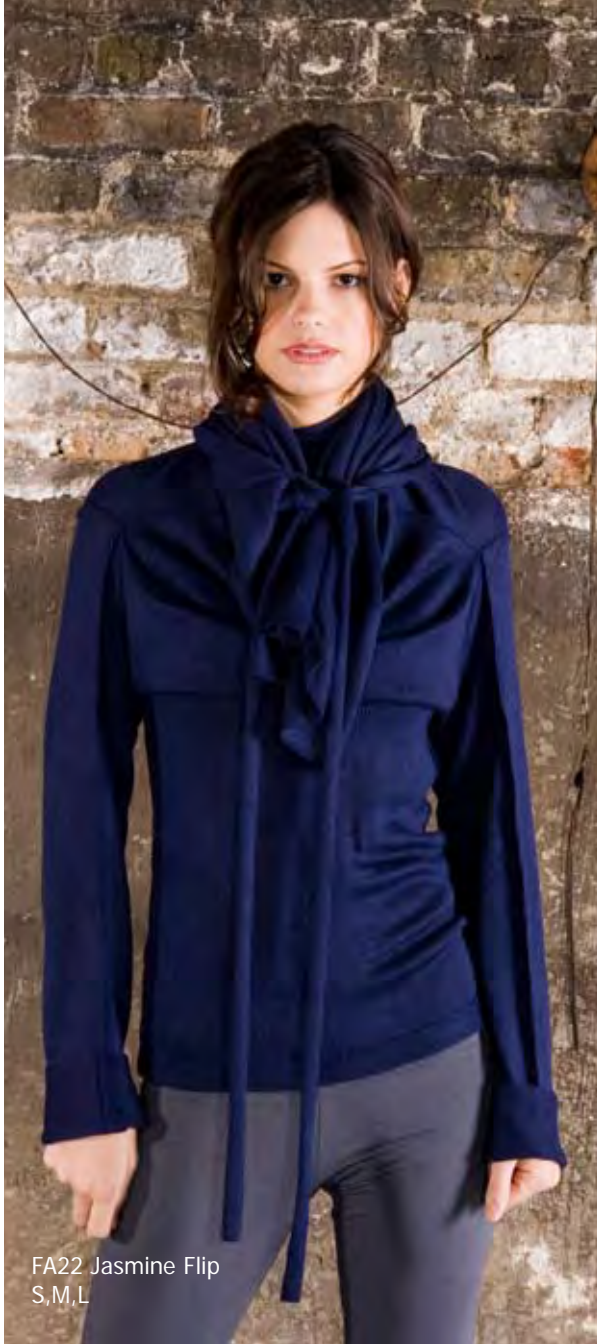
FA22 Jasmine Flip S,M,L