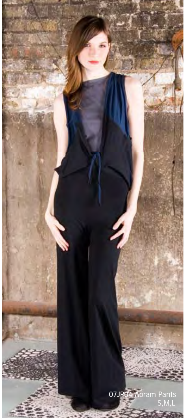
07JP04 Abram Pants S,M,L