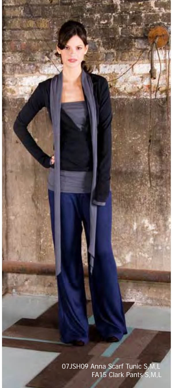
07JSH09 Anna Scarf Tunic S,M,L FA15 Clark Pants S,M,L