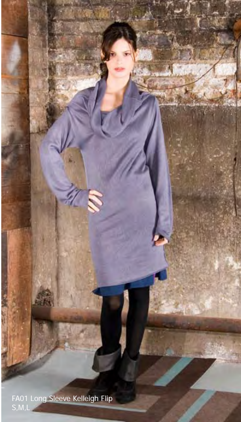
FA01 Long Sleeve Kelleigh Flip S,M,L