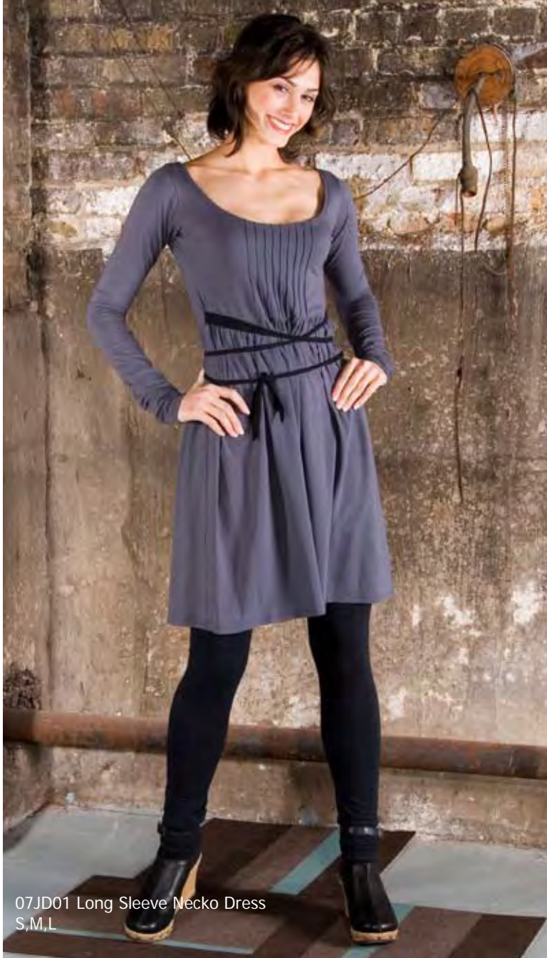
07JD01 Long Sleeve Necko Dress S,M,L