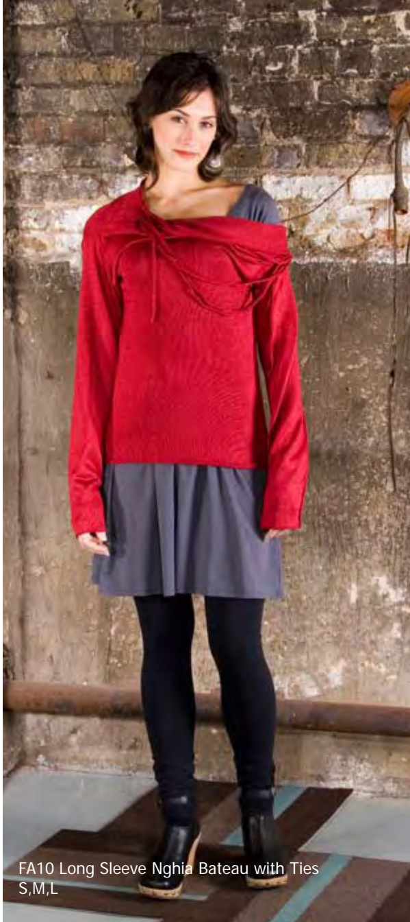
FA10 Long Sleeve Nghia Bateau with Ties S,M,L