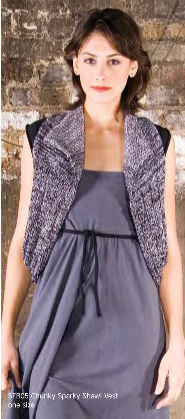
SFB05 Chunky Sparky Shawl Vest one size