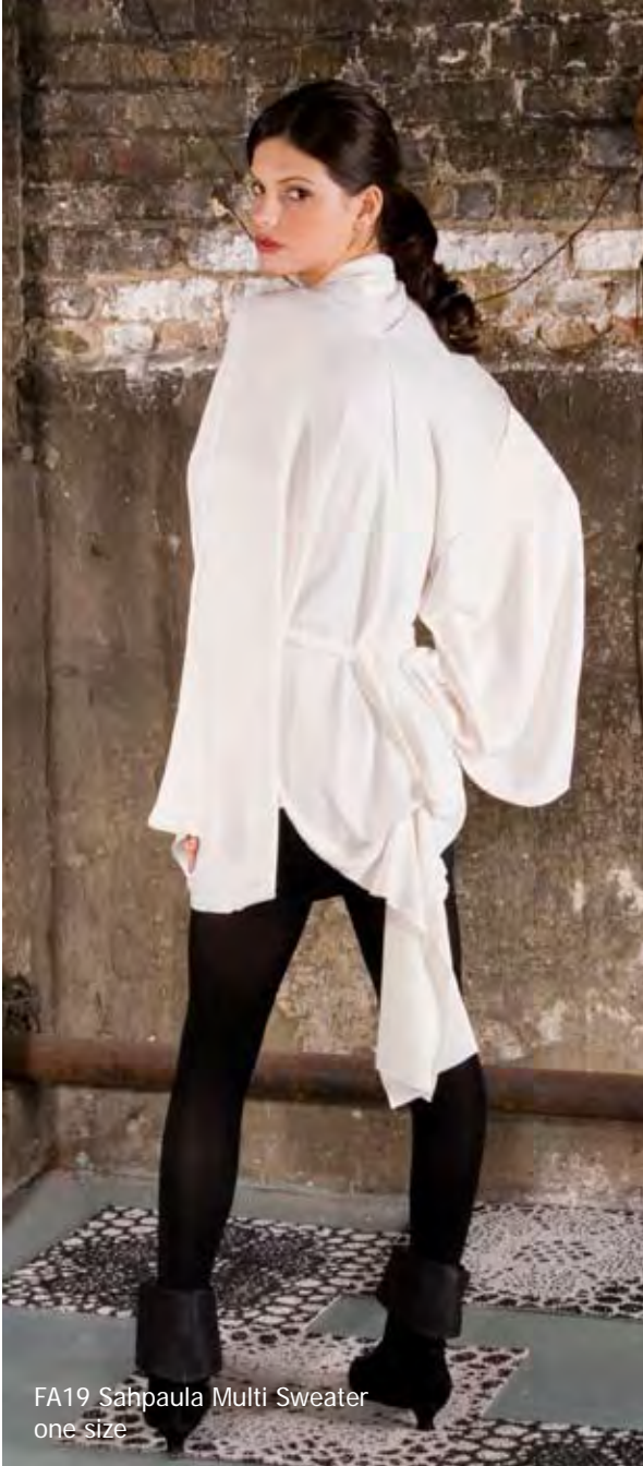
FA19 Sahpaula Multi Sweater one size