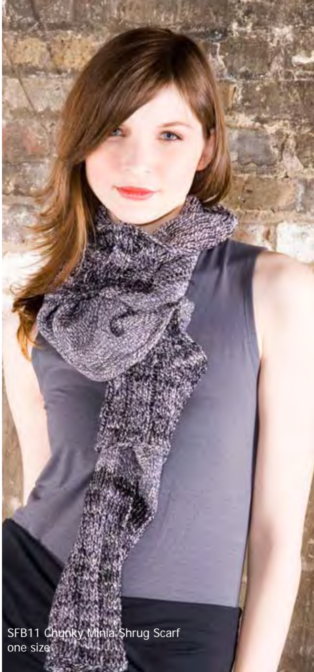
SFB11 Chunky Minia Shrug Scarf one size